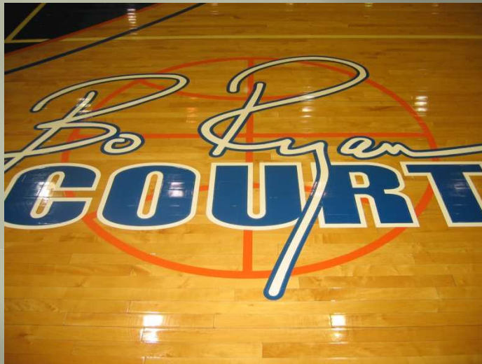
Bo Ryan Court