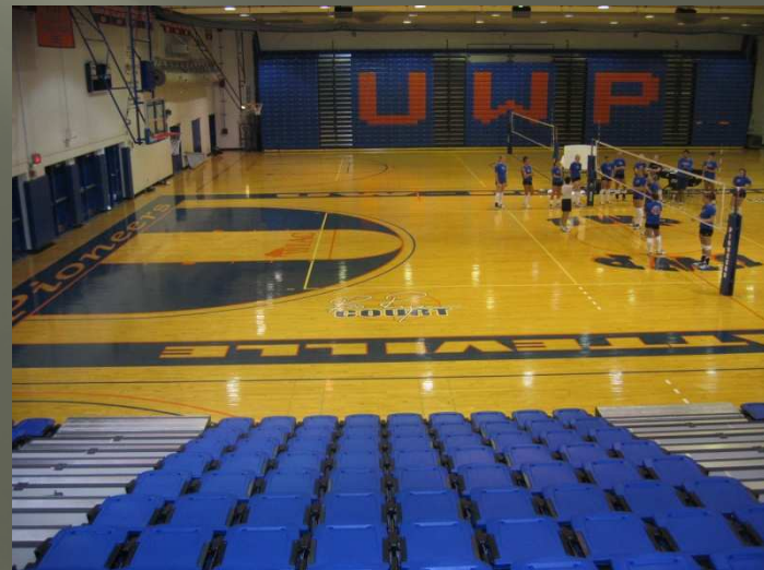
Bo Ryan Court